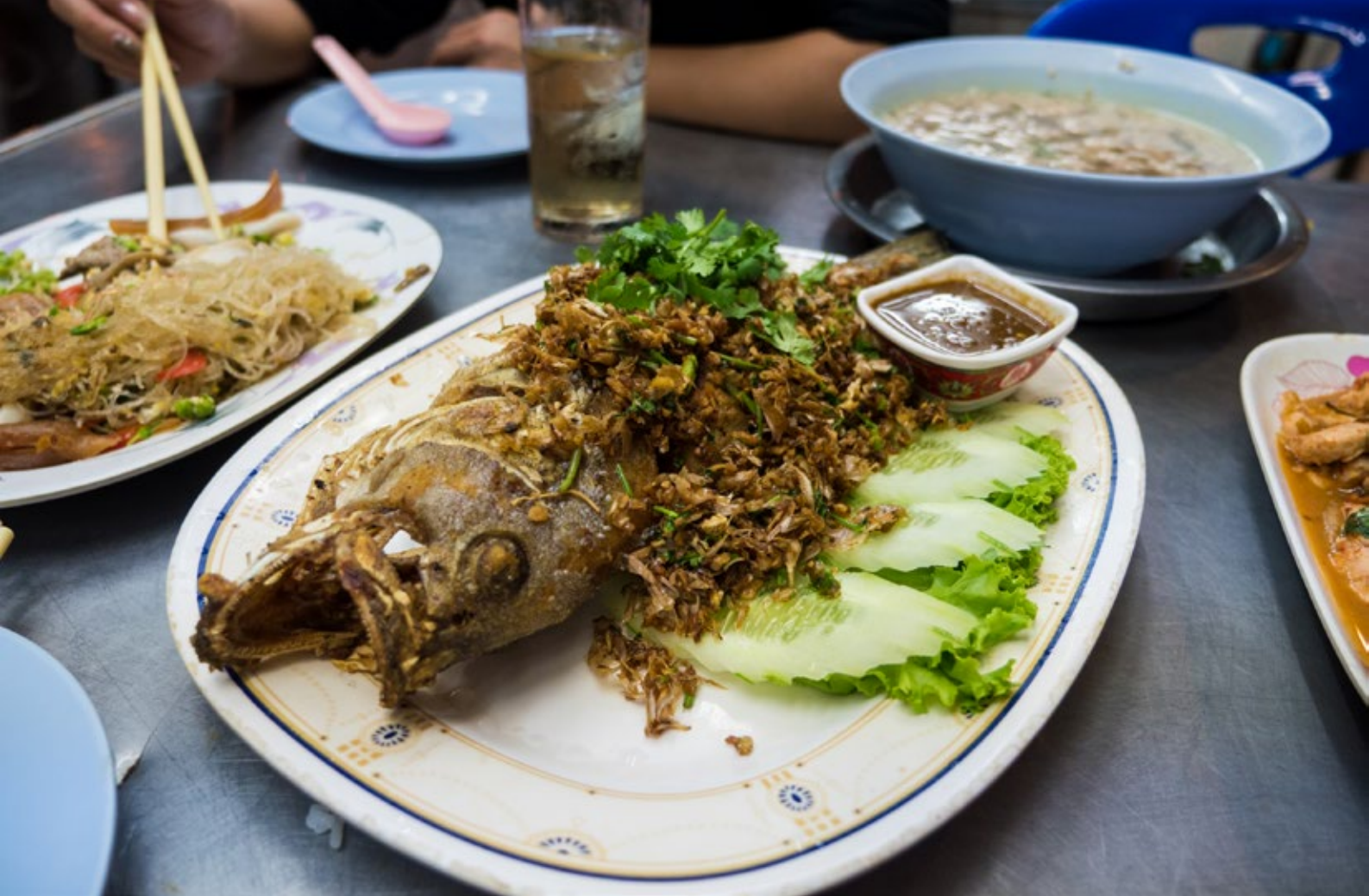
Amazing seafood at Saeng Chai Pochana