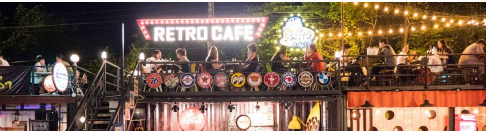
Bar on a shipping container at Talad Rot Fai (Ratchada location)