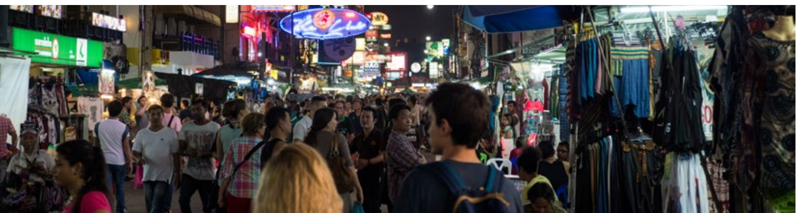
Khao San Road - Backpacker central