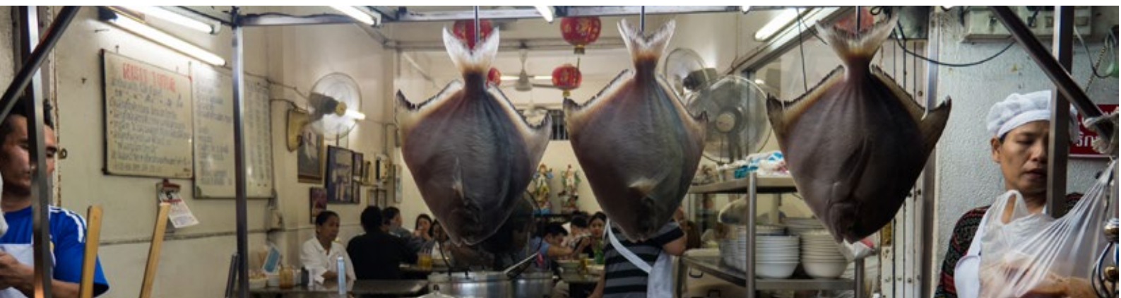
Khao Tom Pla Kimpo