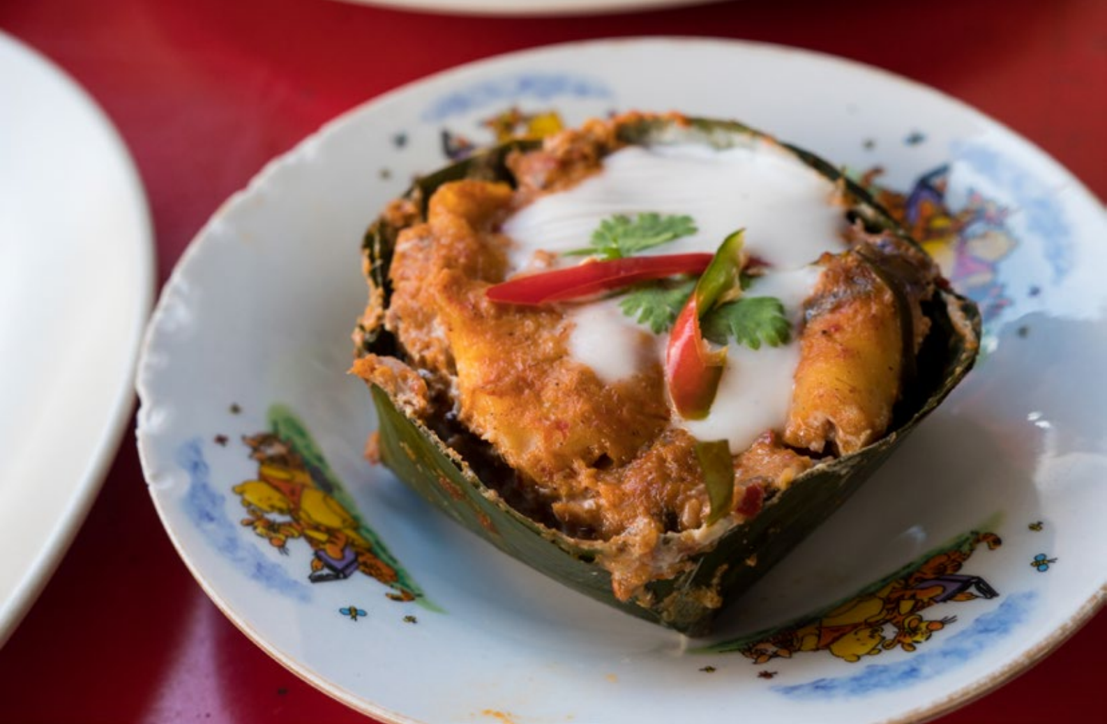
Hor mok (fish custard) at Khao Gaeng Ruttana