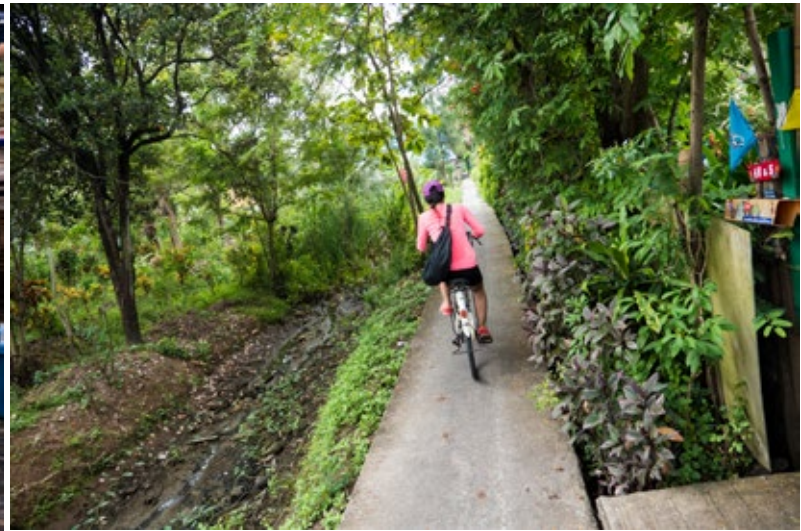
Biking through Bang Krachao