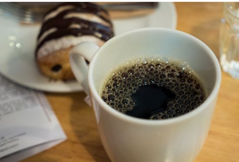
Coffee at Ceresia Coffee Roasters