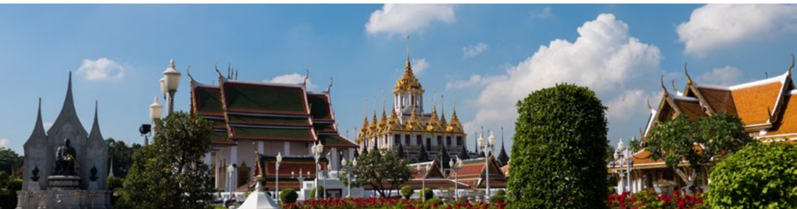
Loha Prasat Temple