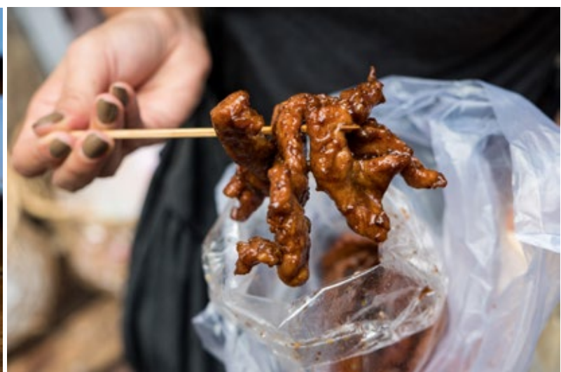
Fried pork at Wang Lang Market