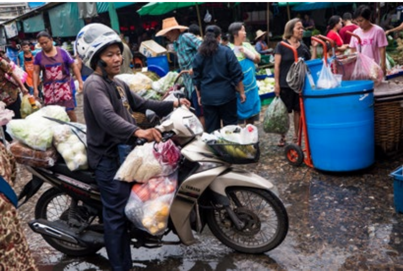
Khlong Toey Market