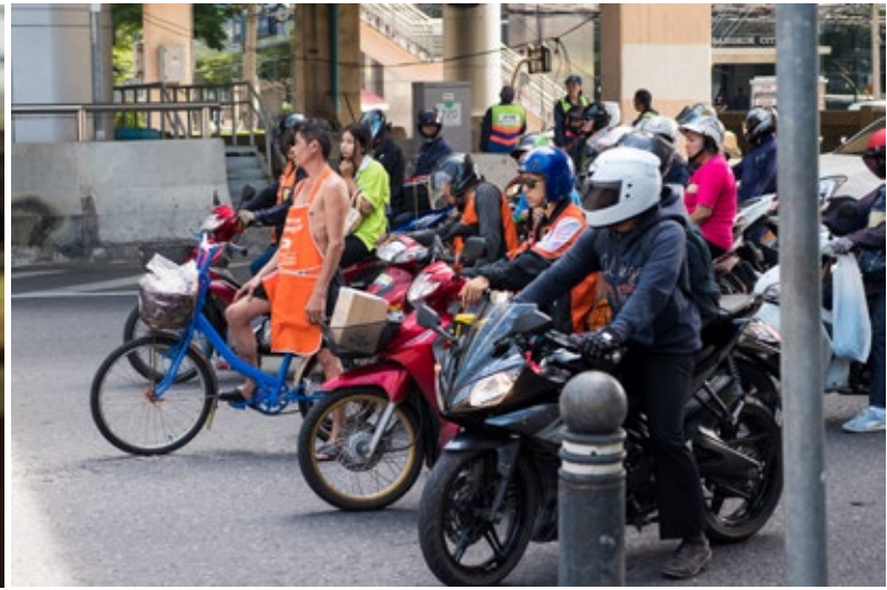
A cool guy on a bicycle in an apron!