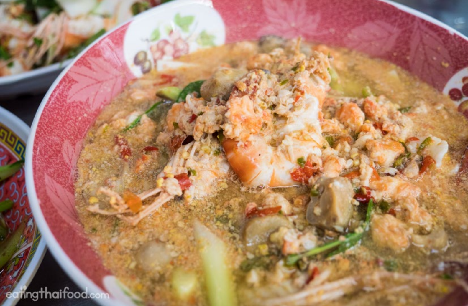
Epic tom yum goong at Tom Yum Goong Banglamphu