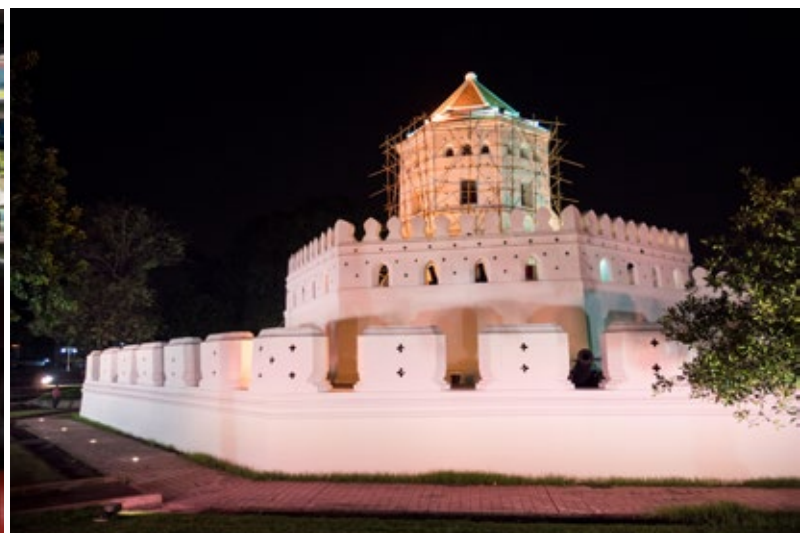
Phra Sumen Fort