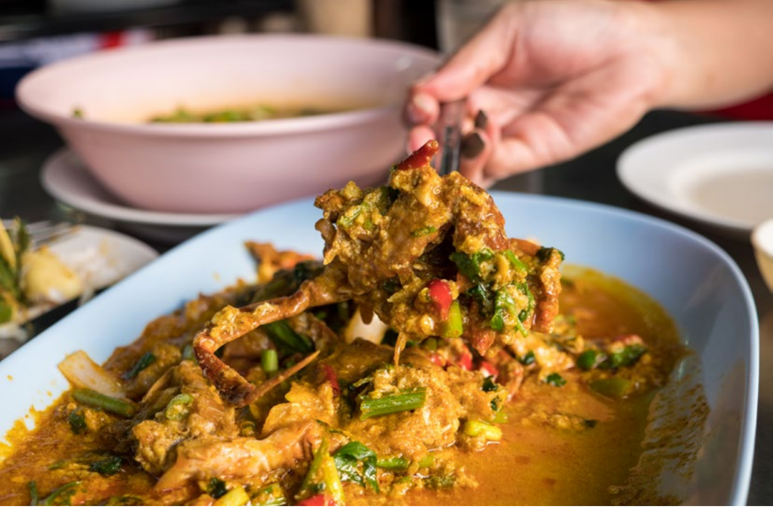
Soft shell crab curry at Soei