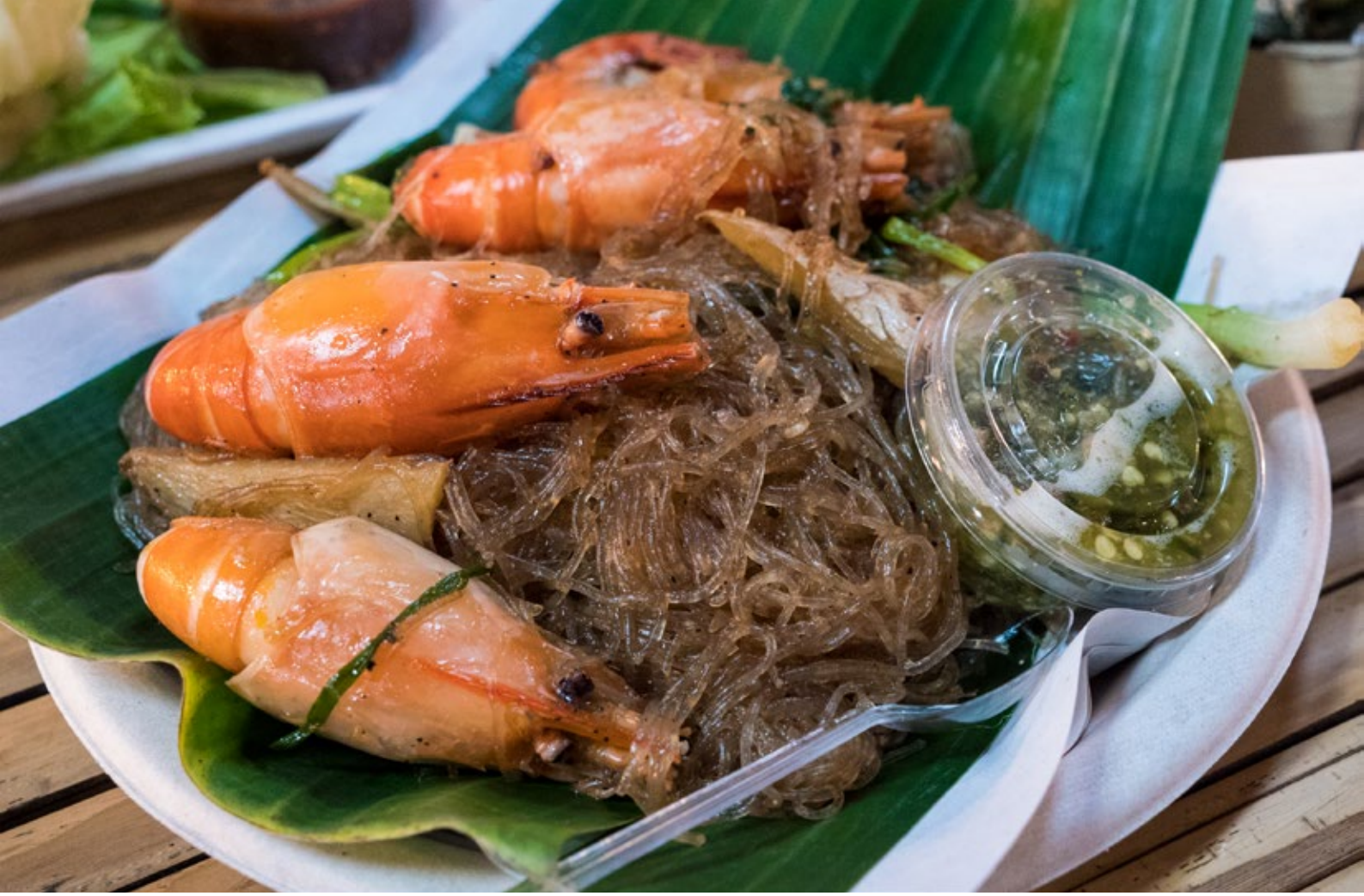
Goong ob woon sen at Khlong Lat Mayom Floating Market