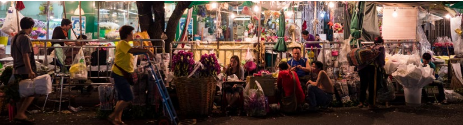
Bangkok flower market on the road