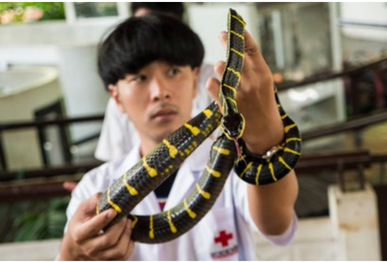
Bangkok snake farm show