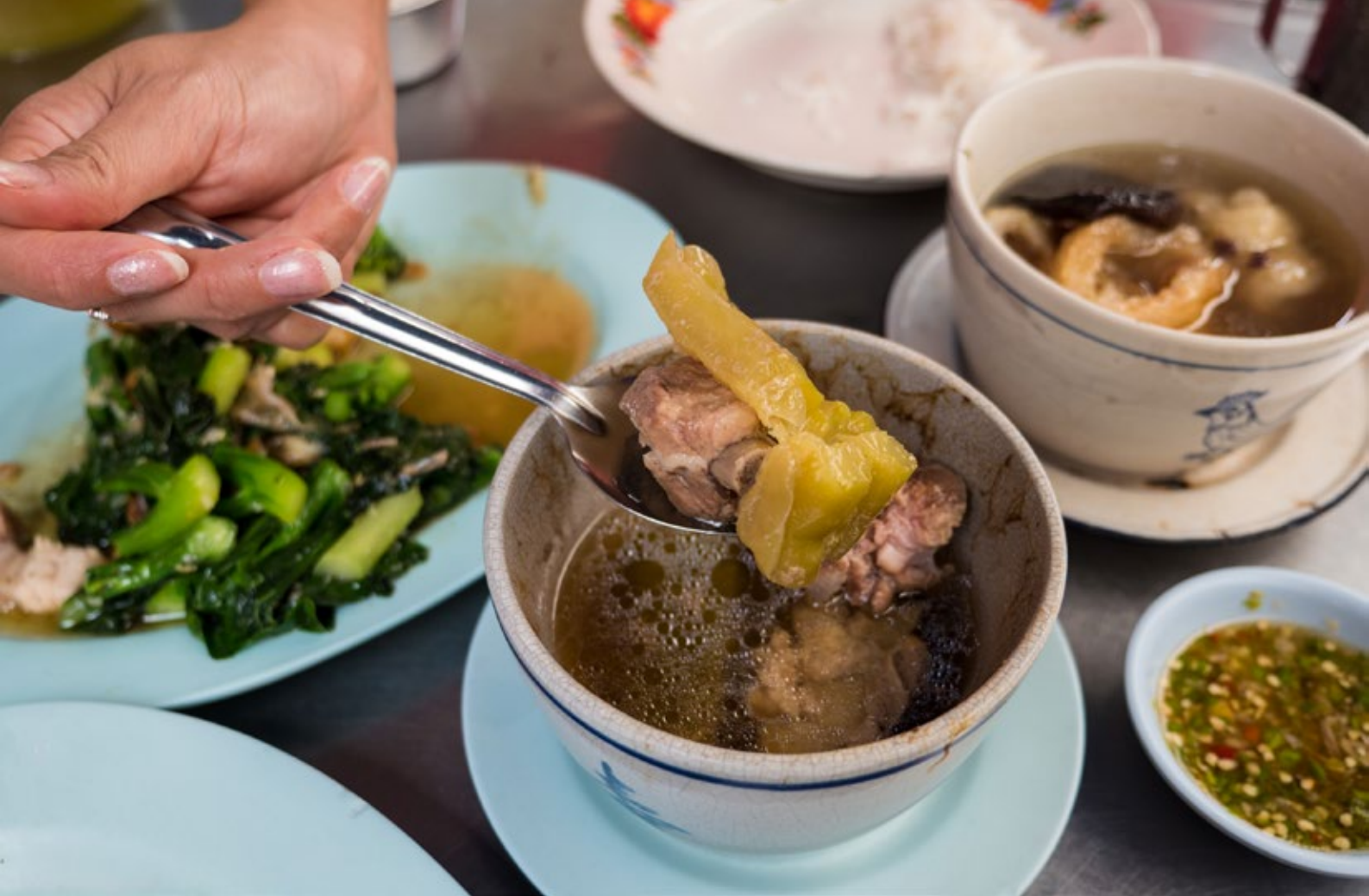
Incredible steamed food at Pa Krua Tuan