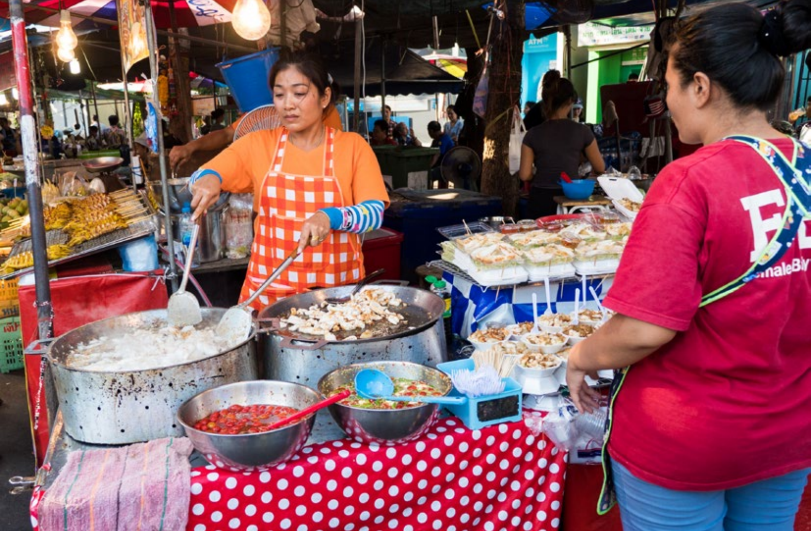
Frying squid eggs at Chatuchak Weekend Market