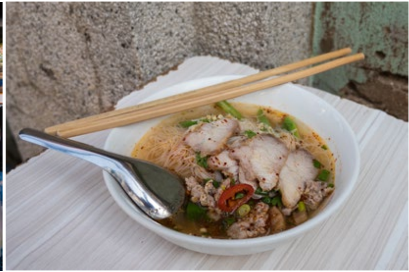
Sukhothai Noodles at Som Song Pochana