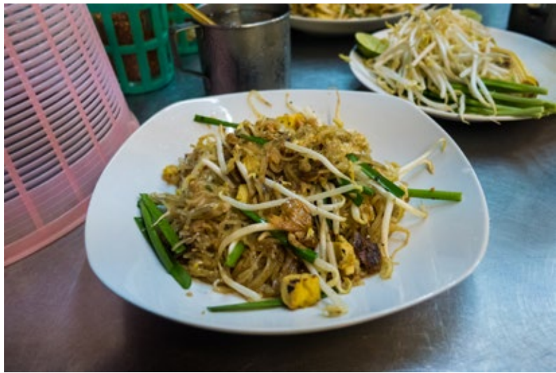
Pad Thai Soi Pradu