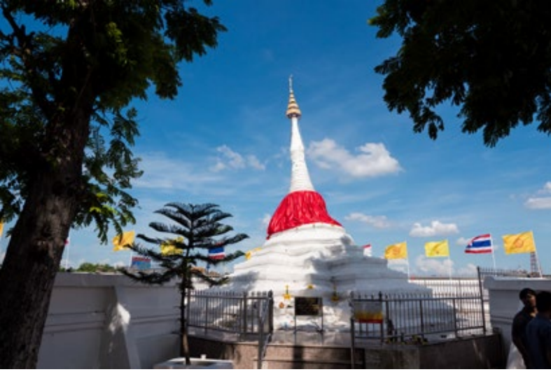
Iconic leaning stupa at Koh Kret