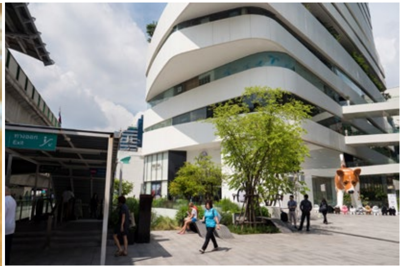
EmQuartier Shopping Mall