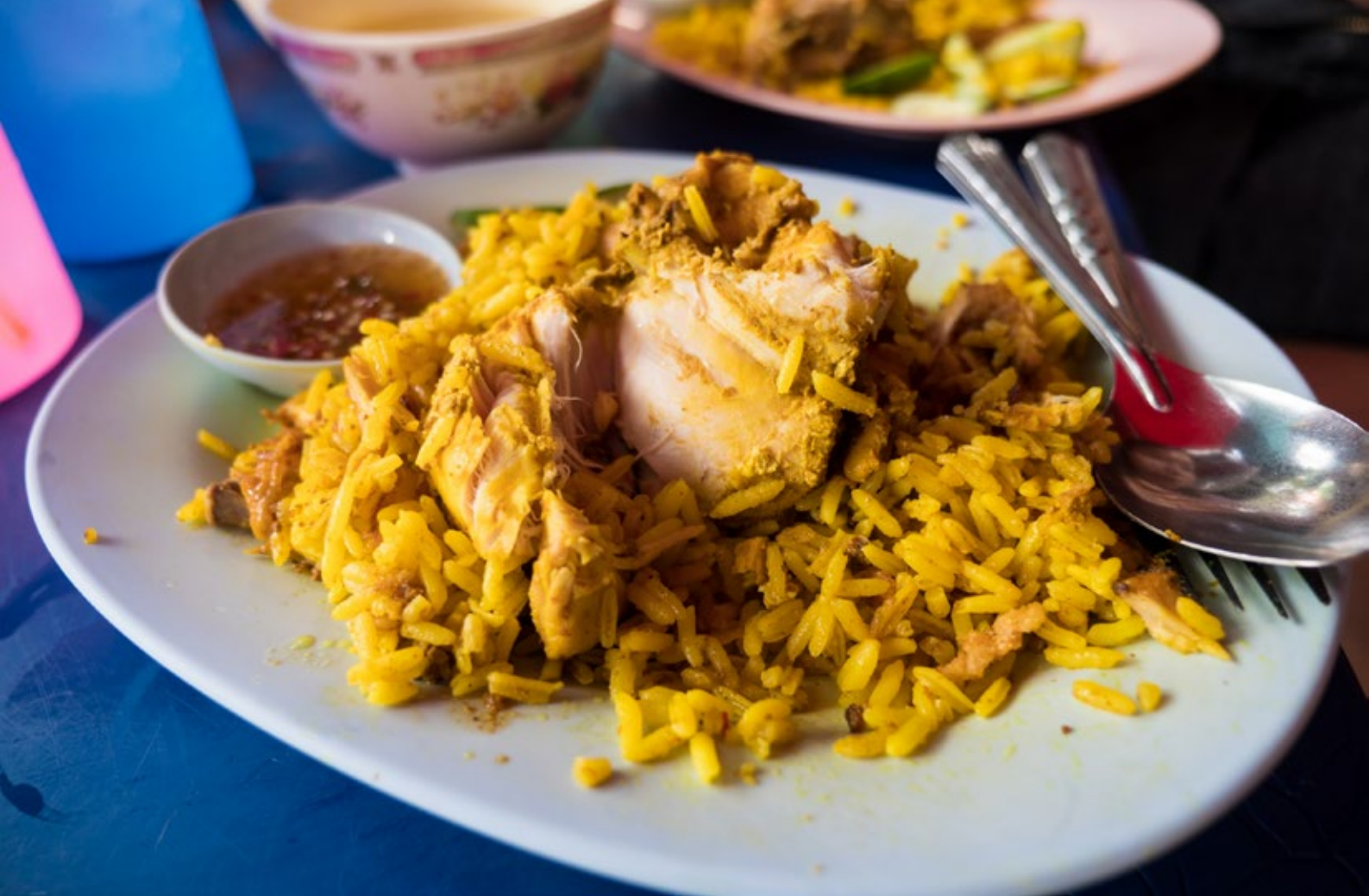
Khao mok (biryani) at Silom Soi 20