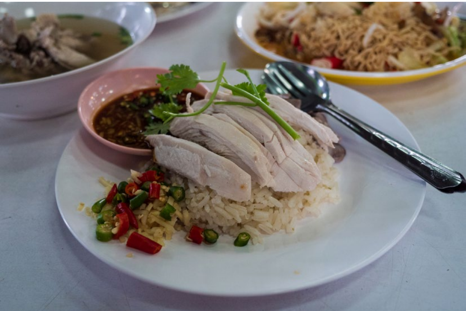
Chicken and rice and Silom Soi 10 food court