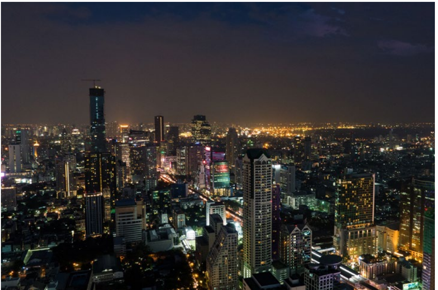
Khao mok (biryani) at Silom Soi 20