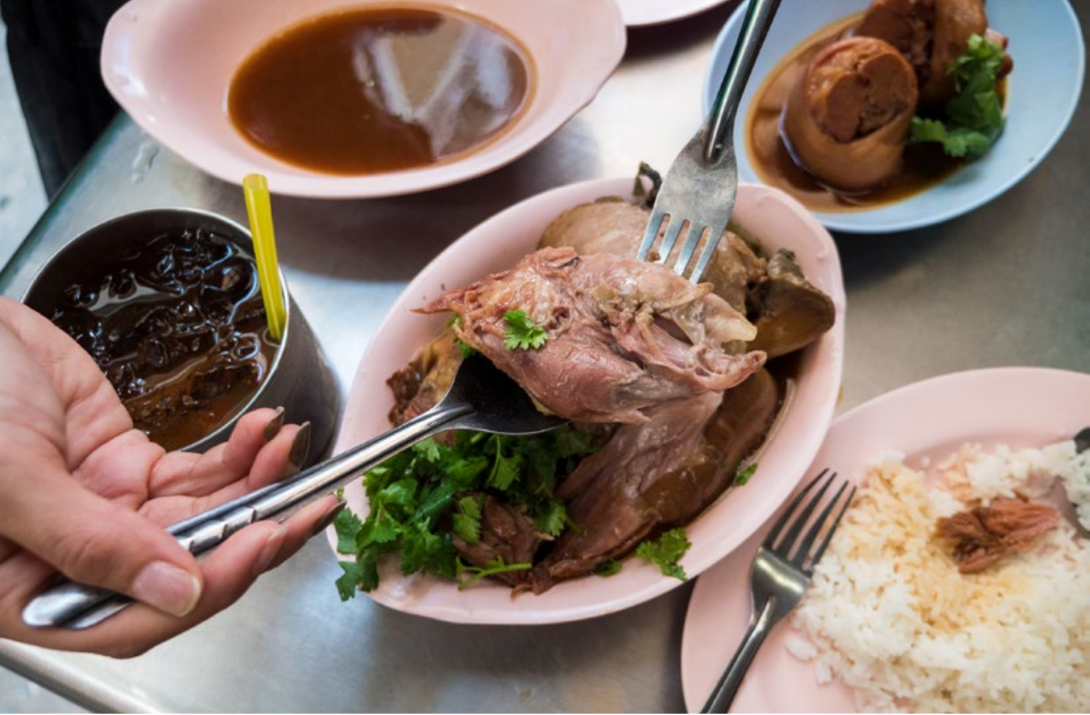
Braised pork leg at Charoen Saeng Silom