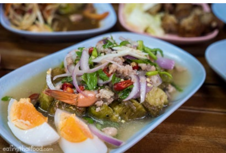
Eggplant salad at Som Tam Sida