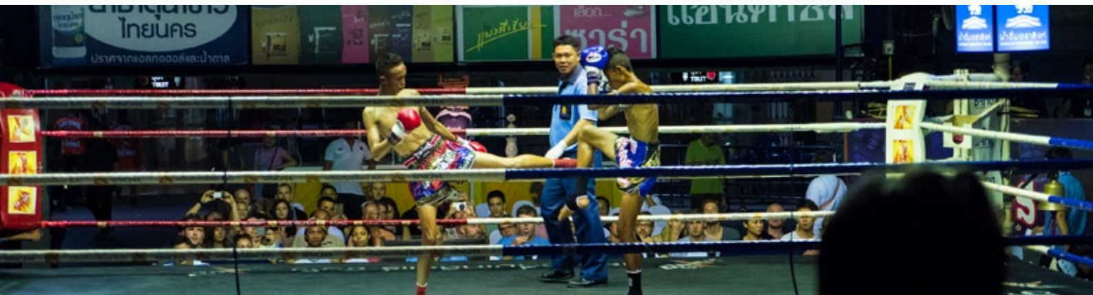
Muay Thai fight at Ratchadamnoen Stadium