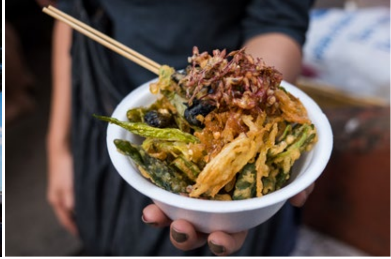
Fried flowers at Koh Kret