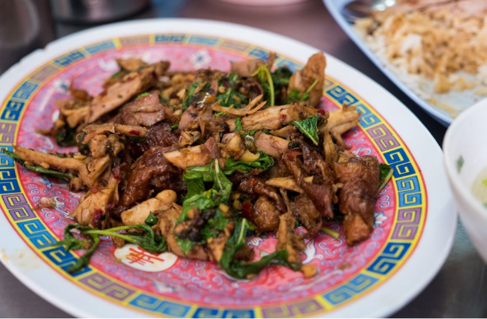
Duck and holy basil at Soi 6 Pochana