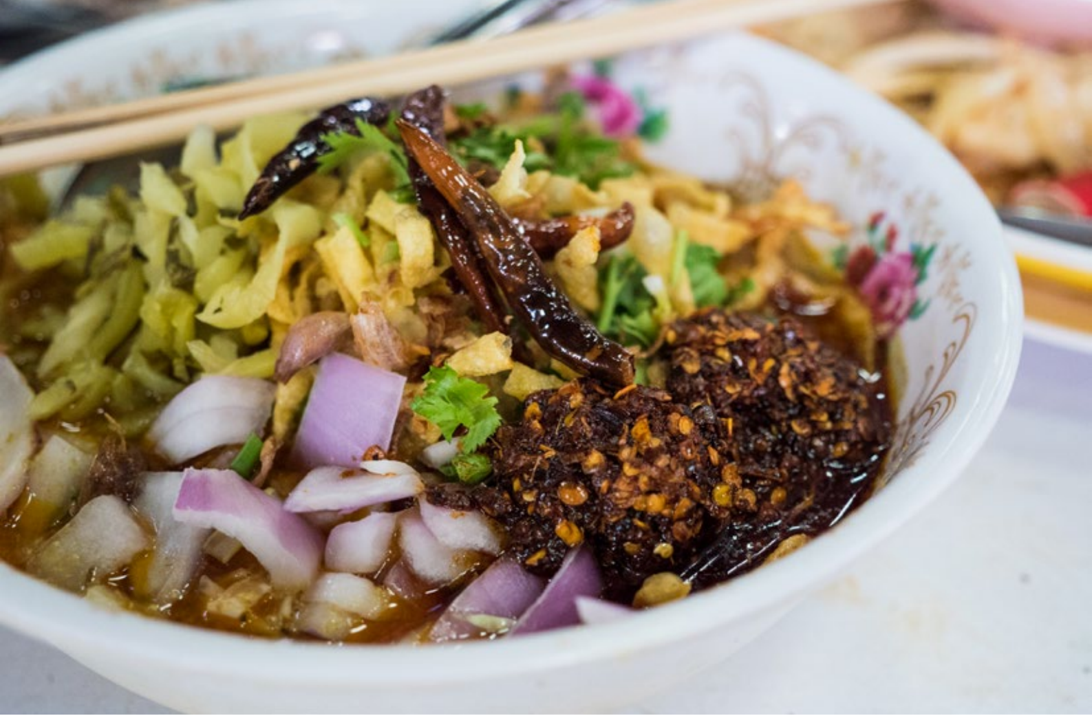
Khao soi (curry noodles) at Silom Soi 10 food court