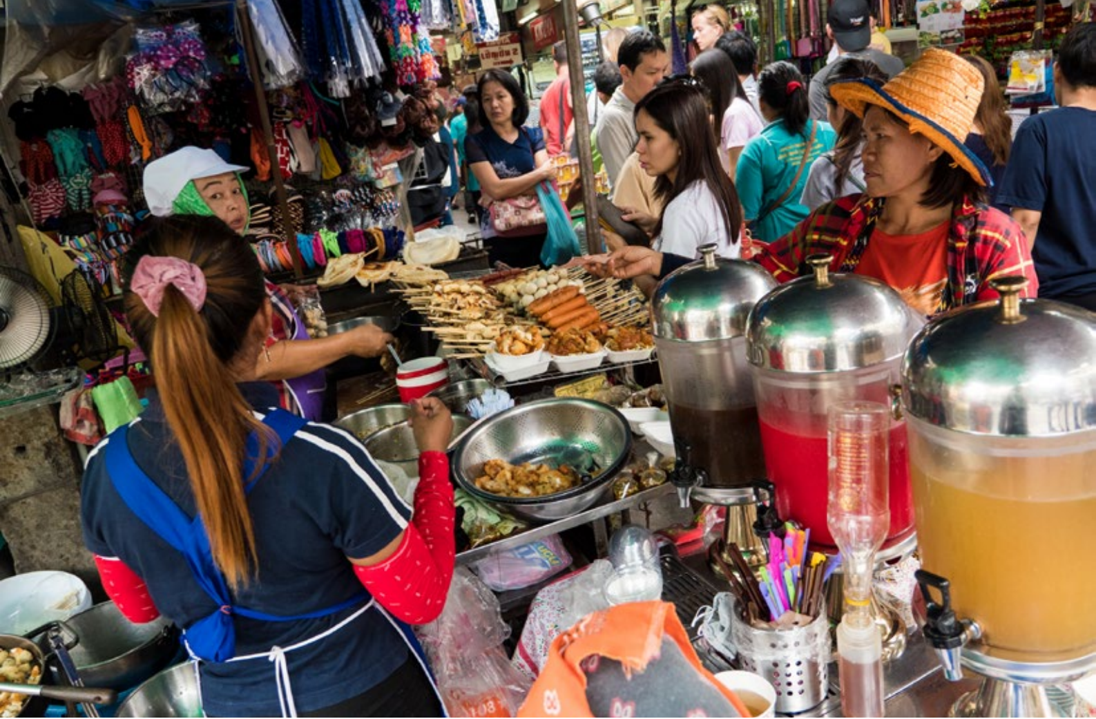
Crowded and busy Sampeng market in Chinatown