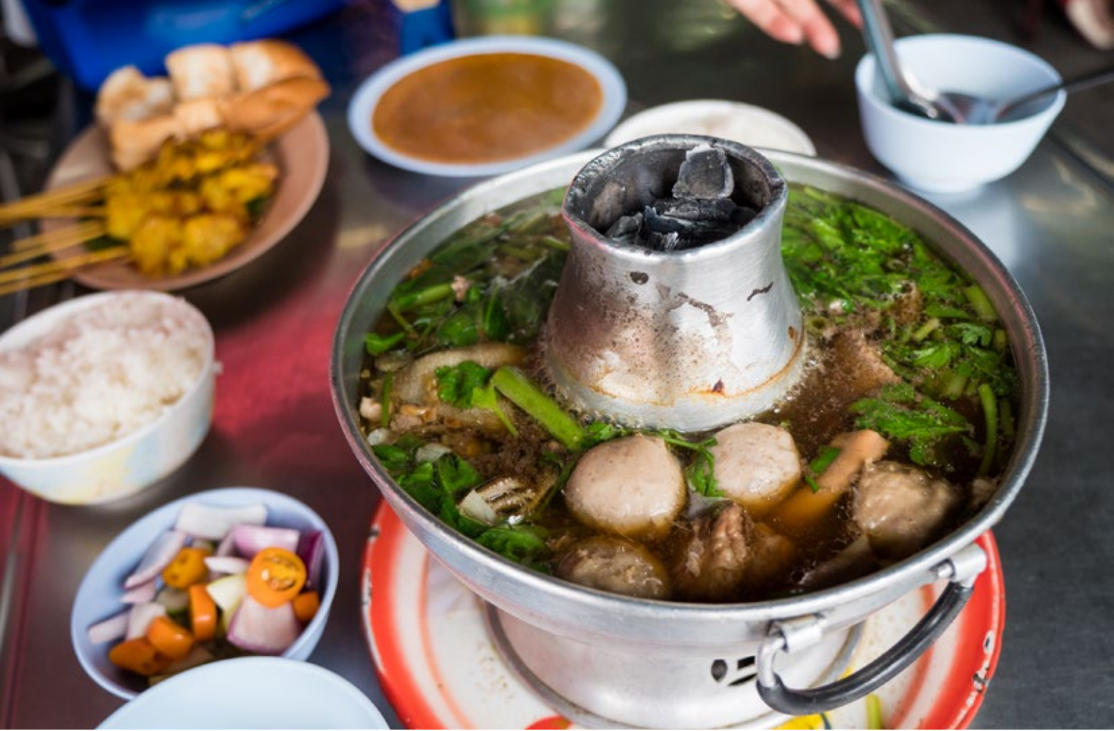
Flaming beef fire pot at Heng Chun Seng