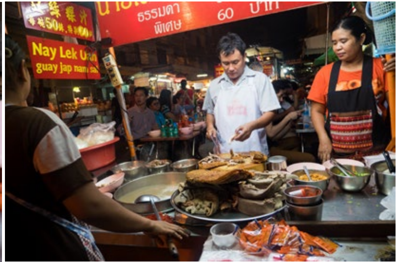
Kuay Jab Nay Letk