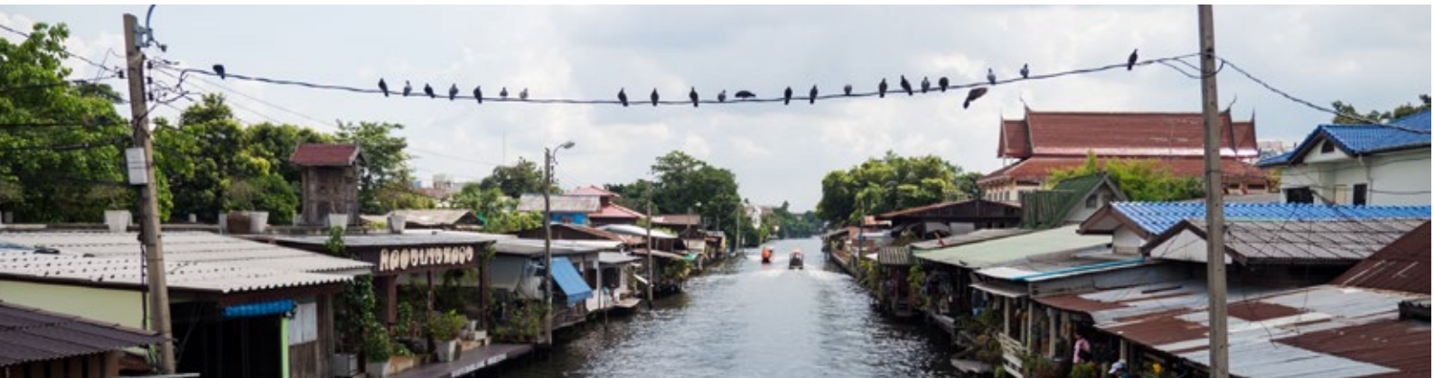
Baan Silapin - also known as Artist's House