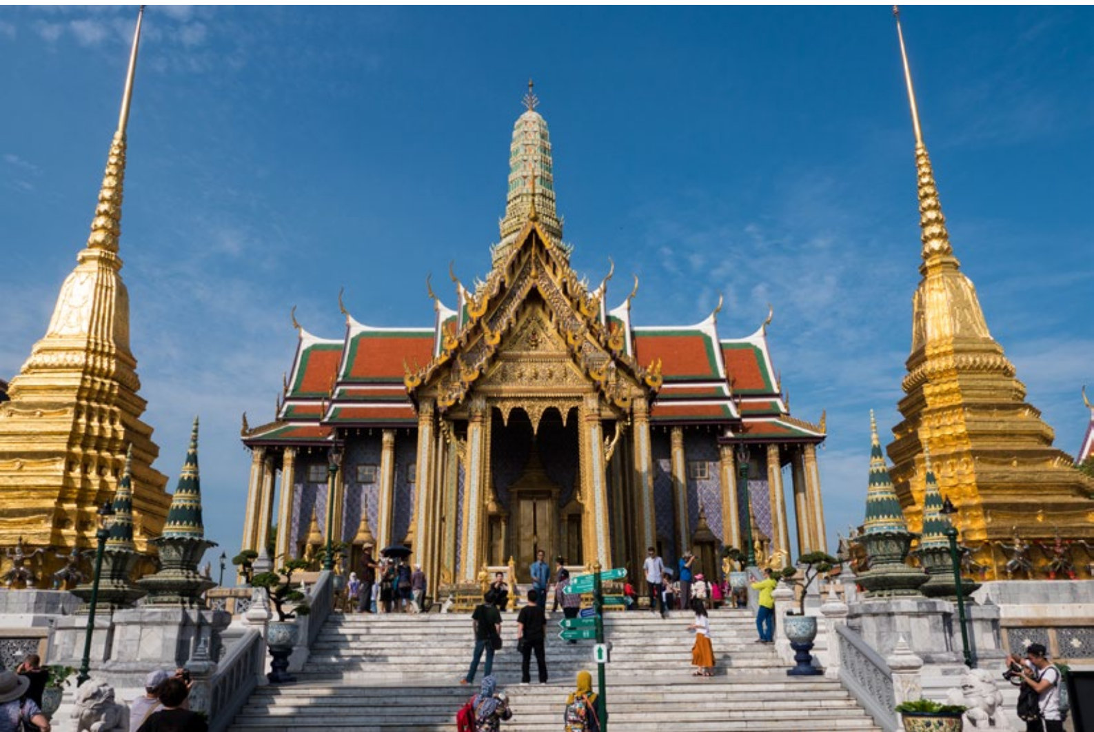
Wat Phra Kaew, Grand Palace

Gai ping (ไก่ปิ้ง) - 10 THB ($0.28) per stick - Street food cart grilled chicken skewers for dinner