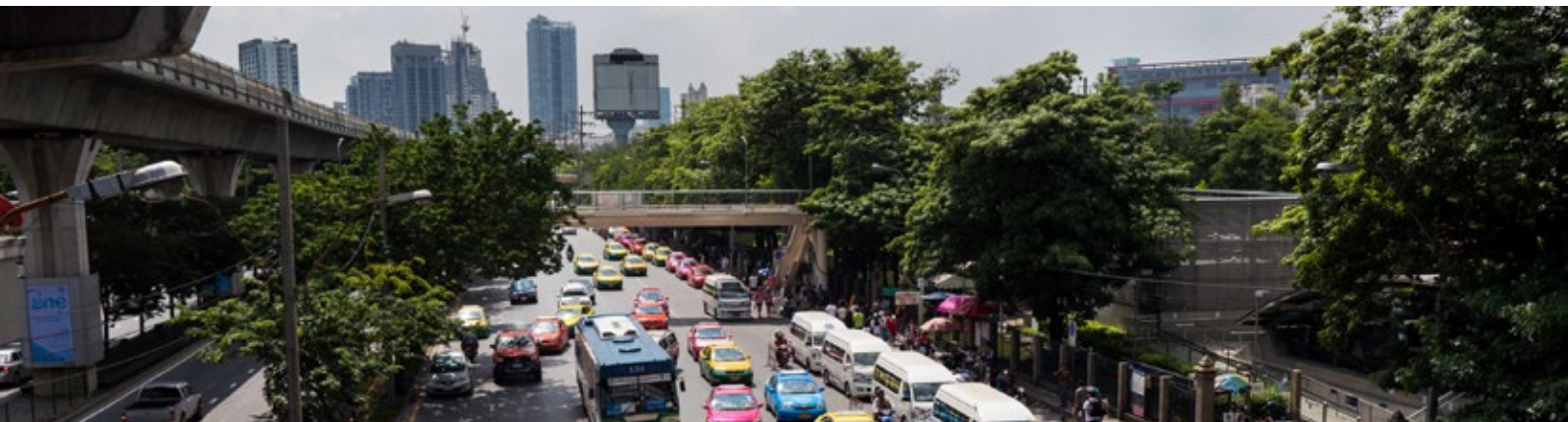
Getting off the BTS to Chatuchak Weekend Market