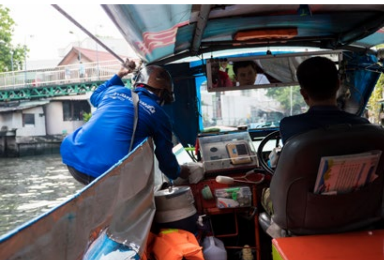
Riding the river boat