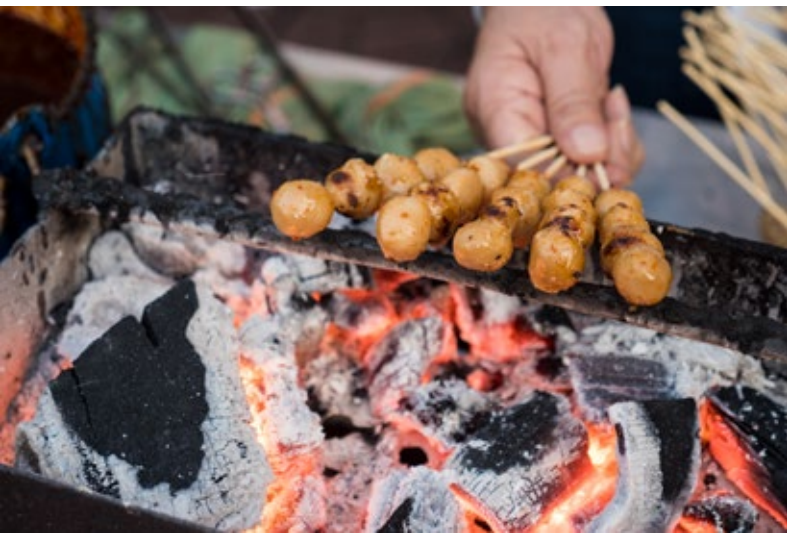
Grilled meatballs at Lookshin Tongchai