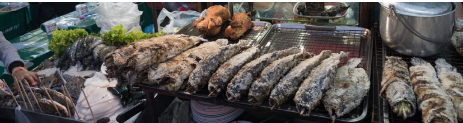
Grilled fish outside Central World at night