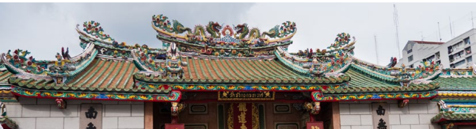
Wat Leng Noi Yee Chinese Temple in Yaowarat