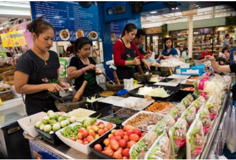
Marvelous papaya salad at Or Tor Kor Market