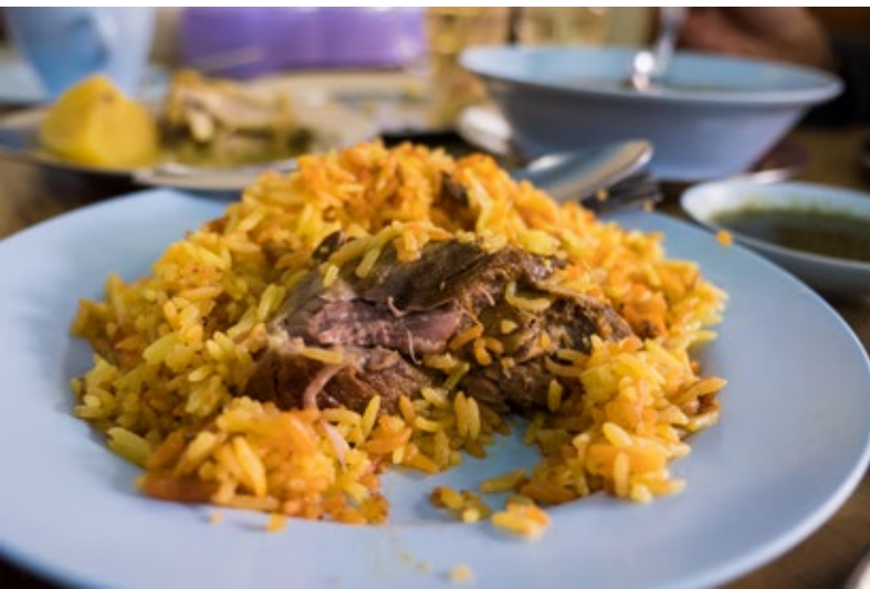
Goat biryani at Muslim Restaurant