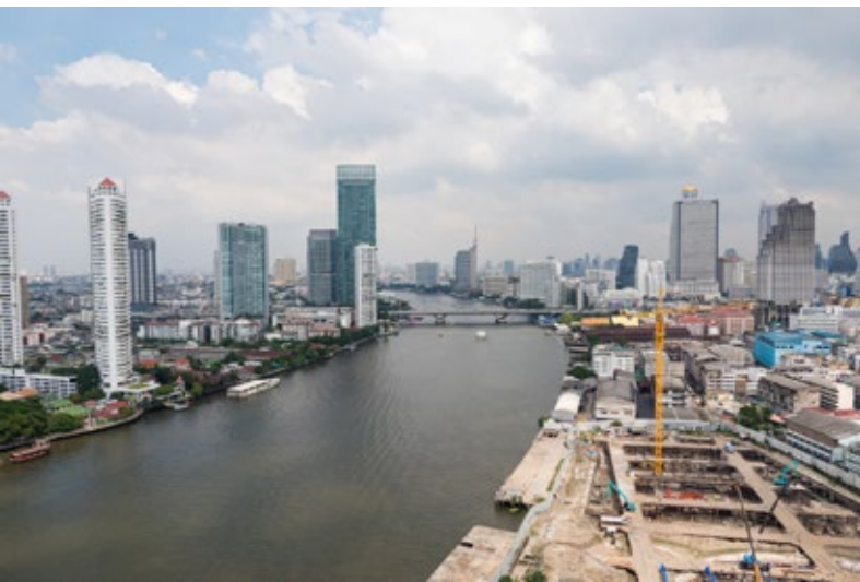
View from our room at Chatrium