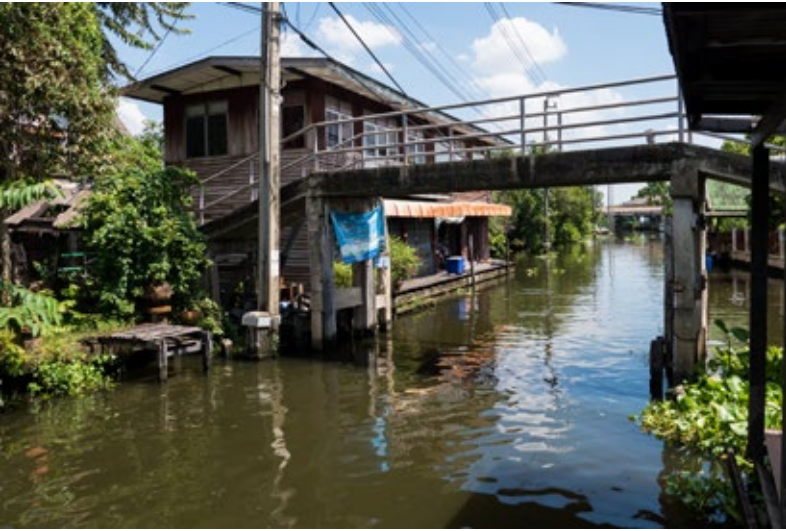
Boat ride tour