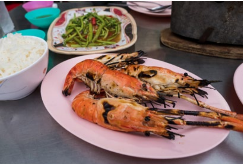
Roasted prawns at Lek and Rut Seafood