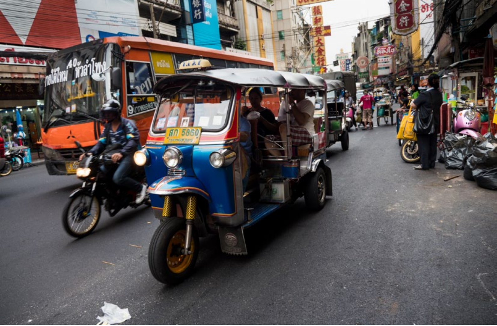
Racing through Yaowarat