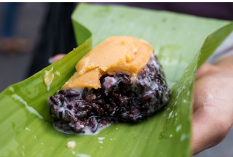
Sticky rice and custard at Silom Soi 20

*Suan Phlu (สวนพลู) Market - Chicken noodles at night