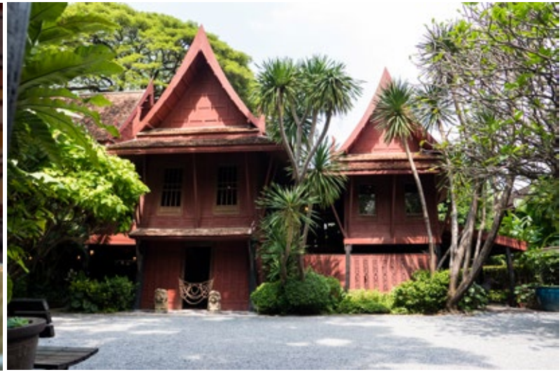
Jim Thompson House