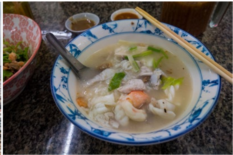
Rice seafood soup