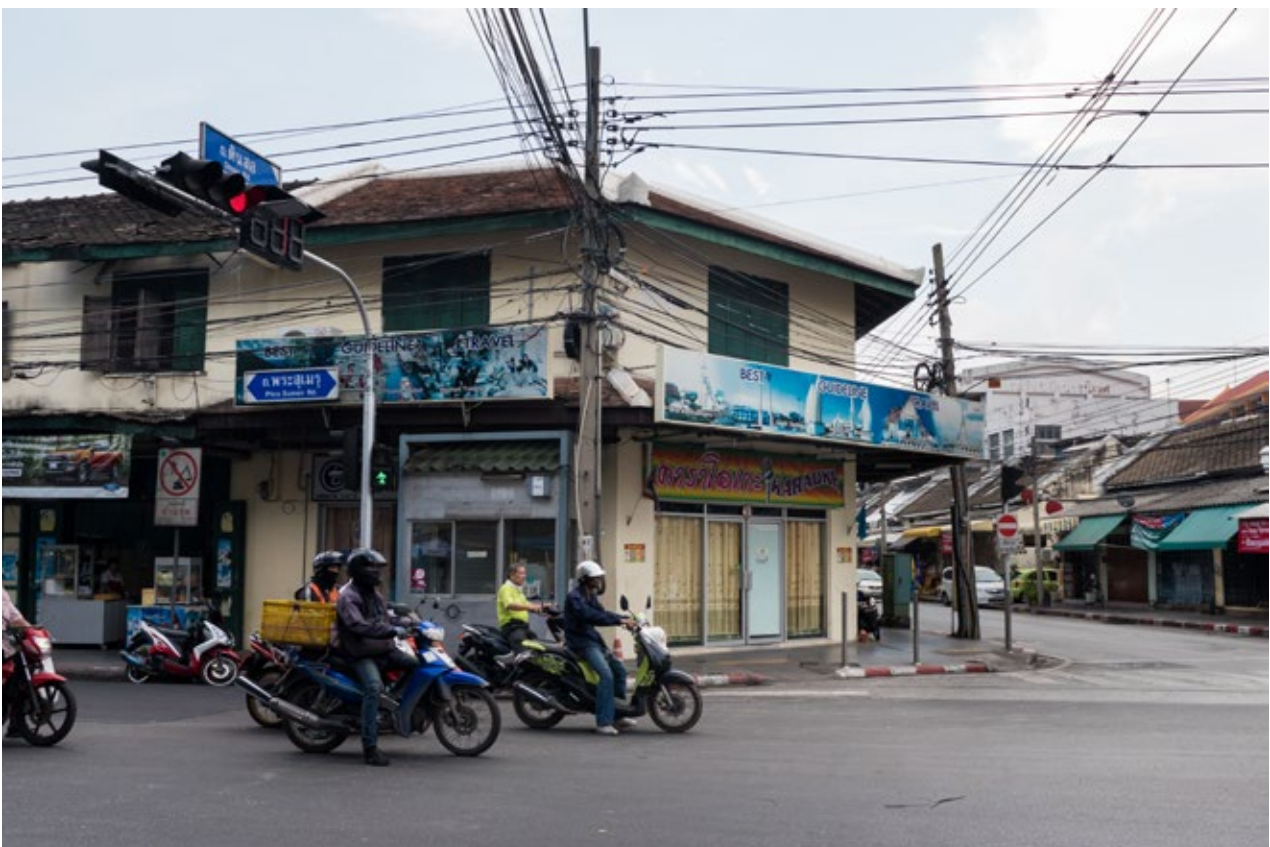
We first stayed in Banglamphu, near Khao San Road

*Roti Mataba (โรตีมะตะปะ) - Halal restaurant - 170 THB ($4.78)