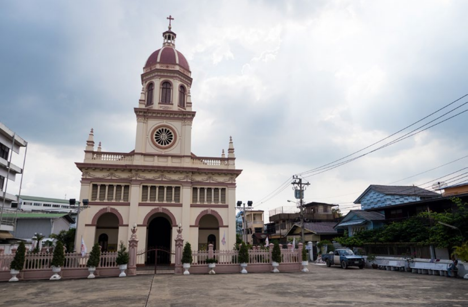
Santa Cruz Church and area