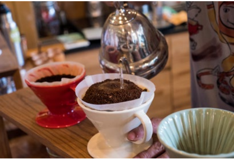
Drip coffee at Gallery Drip