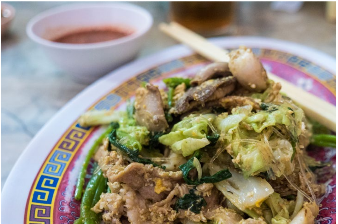
Amazing Thai style suki at Thai Haeng restaurant