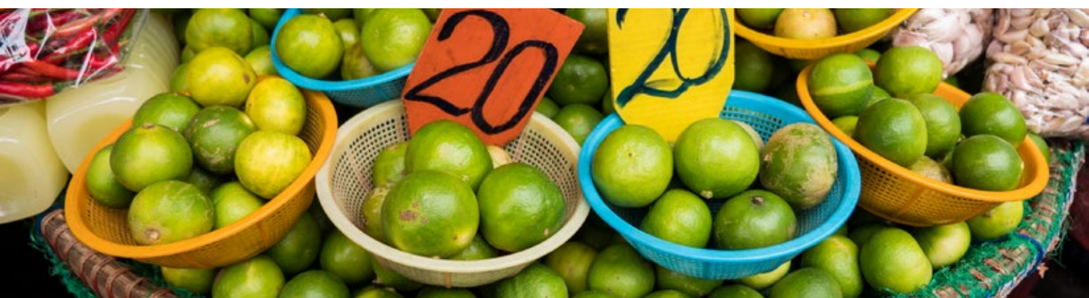
Limes for sale at Khlong Toey Market